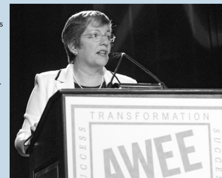
Governor Napolitano addresses the 900+ crowd at the AWEE luncheon and shared her concern for women and children's issues and their connection to advancing the health of the state.