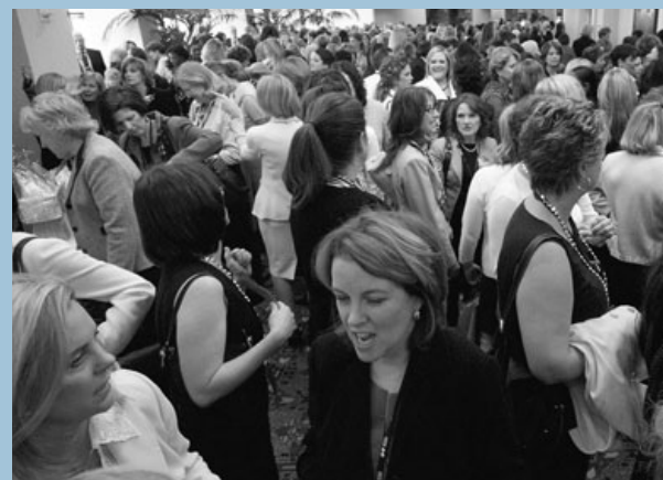
Networking was in full gear at the Arizona Biltmore Resort & Spa as AWEE welcomed a record crowd of 900 fun-loving and kind-hearted women revved up to change lives and win fun giveaways and silent auction items.