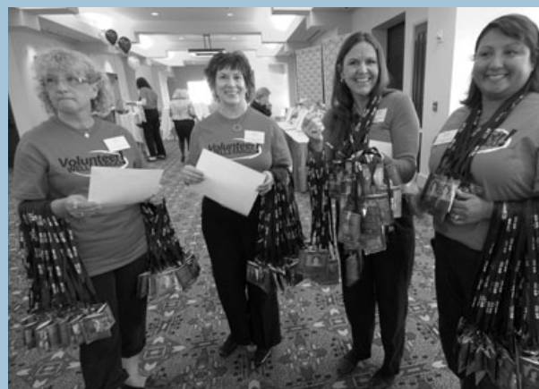
Wells Fargo volunteers stand ready to greet luncheon guests and offer them a special lanyard highlighting 10 different stories of an outstanding AWEE participant's journey of transformation. Special thanks to Blue Cross Blue Shield of Arizona for sponsoring the lanyards and Wells Fargo for being such enthusiastic partners in the Faces of Success event.